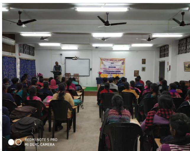
Celebration of National Youth Day