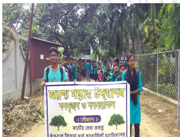
Observation of Aranya Saptaha