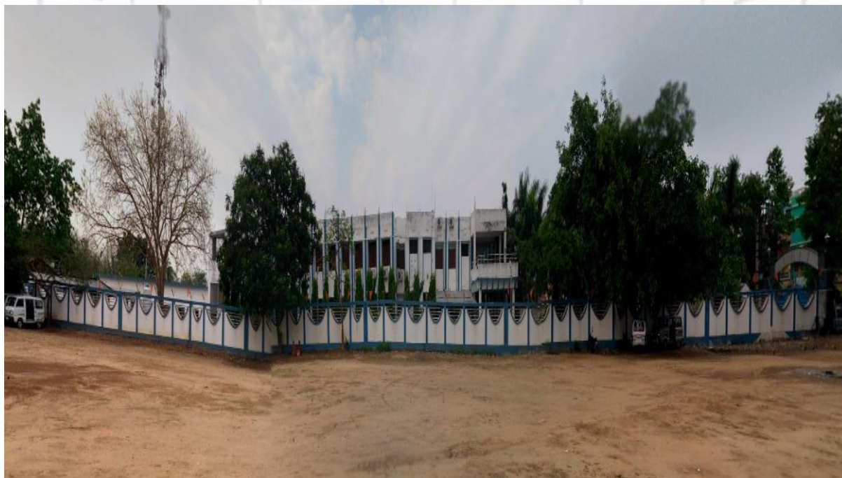
FRONT VIEW OF THE COLLEGE

Our Santal Bidroha Sardha Satabarshiki Mahavidyalaya reminds us about the great historical event of Santal Revolt that took place in 1855. The college is fittingly named as it was established on August 1st, 2005. It is situated at Goaltore in the district of Paschim Medinipur, a place which is mainly inhabited by ST, SC and Other Backward Class people. The College has rendered a tremendous boost to the students of the vast locality. At present the college offers 14 Honours and 19 General courses of study including well equipped laboratories. Many subjects have been introduced within a short span of ten years. Our achievement has really been incredible. The college is affiliated to Vidyasagar University since its inception 2005. The College is recognized under section 2 (f) vide its letter no. 8-275/2013 (Cpp-t/C), Dated: 27/08/2013 and also 12B on 07/11/2013. From the very beginning the institution is trying to render qualitative education and arouse consciousness among the students in all spheres of life through different academic and co-curricular activities. Santal Bidroha Sardha Satabarshiki Mahavidyalaya was accredited by NAAC with Grade B+ on 2 nd May 2017. During the last few years after the completion of Cycle I accreditation by the NAAC, Santal Bidroha Sardha Satabarshiki Mahavidyalaya has made substantial progress both in qualitative as well as quantitative terms in providing quality education.