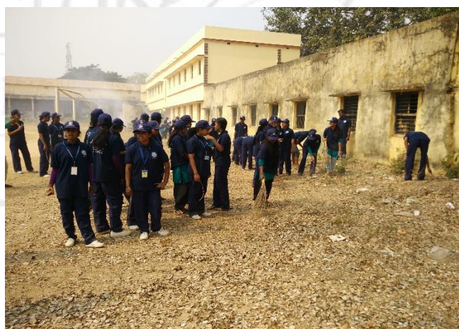
Winter Special Camp